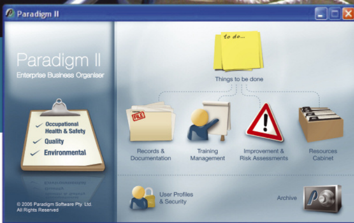
Paradigm II Enterprise Business Organiser Launcher Screen.

Modular software scalable to suit small and large Business